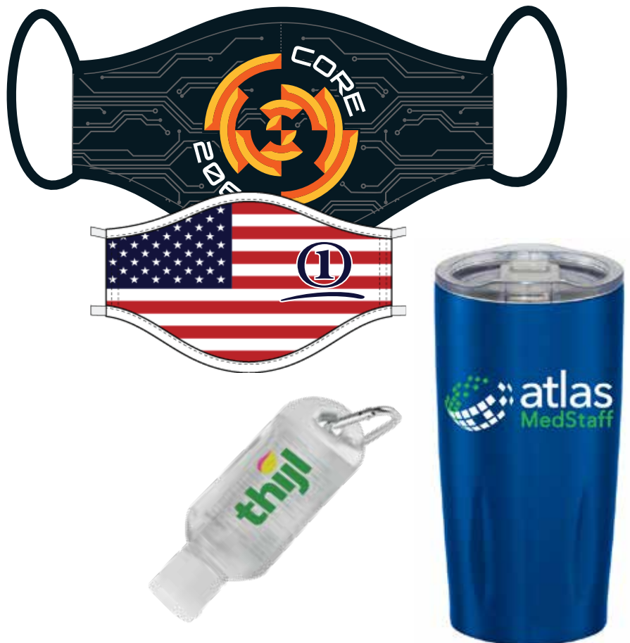
TWO SUBLIMATED MASKS, HAND SANATIZER, TUMBLER,

Tumbler - Do not miss the most trendy tumbler of the year. Durable, double-wall stainless steel vacuum construction, which allows your beverage to stay cold for 15 hours and at least 5 hours for hot beverages.