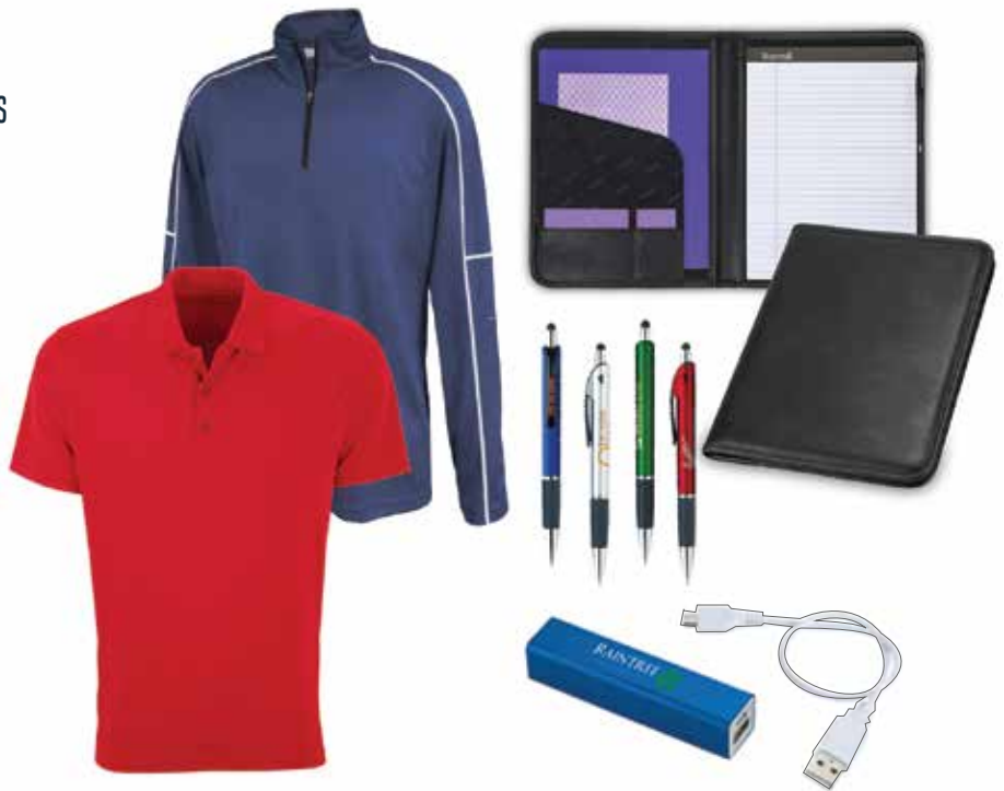
DECORATED POLO, DECORATED ¼ ZIP, PADFOLIO, POWER PACK, PENS

Power Pack -The 5V/1A USB output means that it charges at the same rate of most wall chargers. Includes a USB to Micro USB connecting cable which can recharge the battery backup or be used to charge up devices with a Micro USB input. This product passed UL Standards.