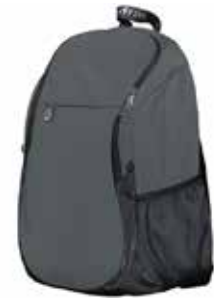
FREE FORM . . . . . $48.00