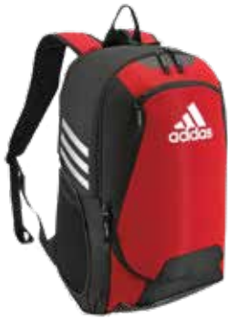
STADIUM II . . . . . $48.00