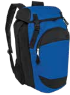
GEAR BAG . . . . . $28.00