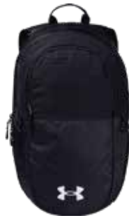
ALL SPORT . . . . . $41.00