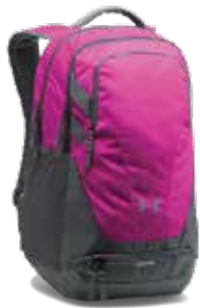
HUSTLE 3.0 . . . . . $41.00