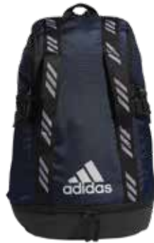
CREATOR 365 . . . . $58.00